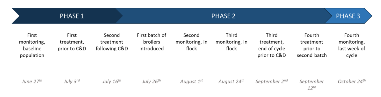
Fig. 1. Monitoring and treatment timeline over the two production cycles. The varying size and thickness of the capsules allow the actives to be released in a controlled manner. Thicker membranes allow for a controlled release, meaning product can remain effective for up to 3 months.

The field trial began on the 27<sup>th</sup> June 2019 and was completed on the 24<sup>th</sup> October of the same year. Litter beetle population monitoring and treatment spanned two full production cycles. Monitoring of the base litter beetle population was recorded on June 27<sup>th</sup> immediately following the removal of the previous batch and was subsequently performed on three more occasions, the last occasion being in the final week of the second production cycle.